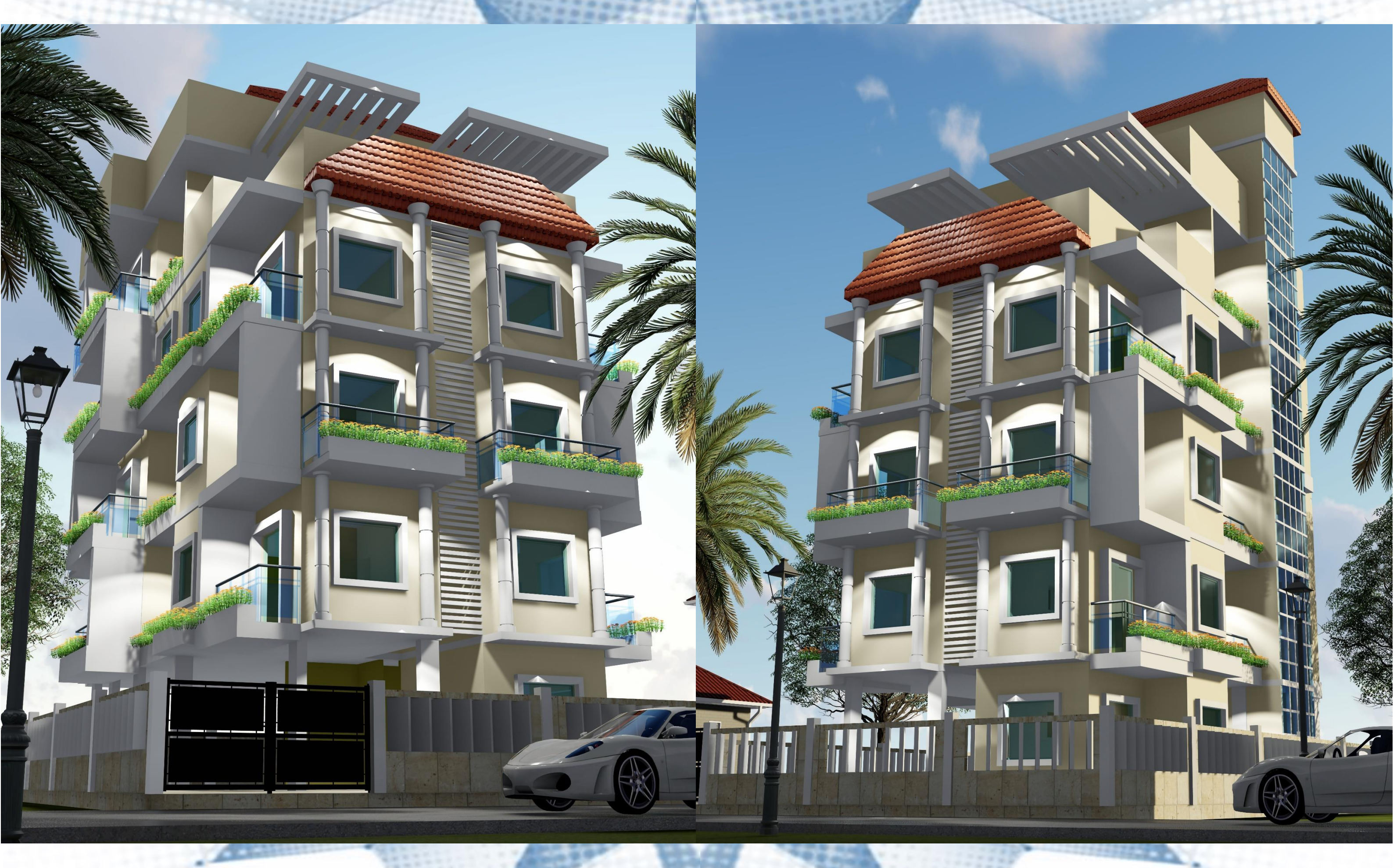
Aesthetically pleasing views to refresh your mind and soul.