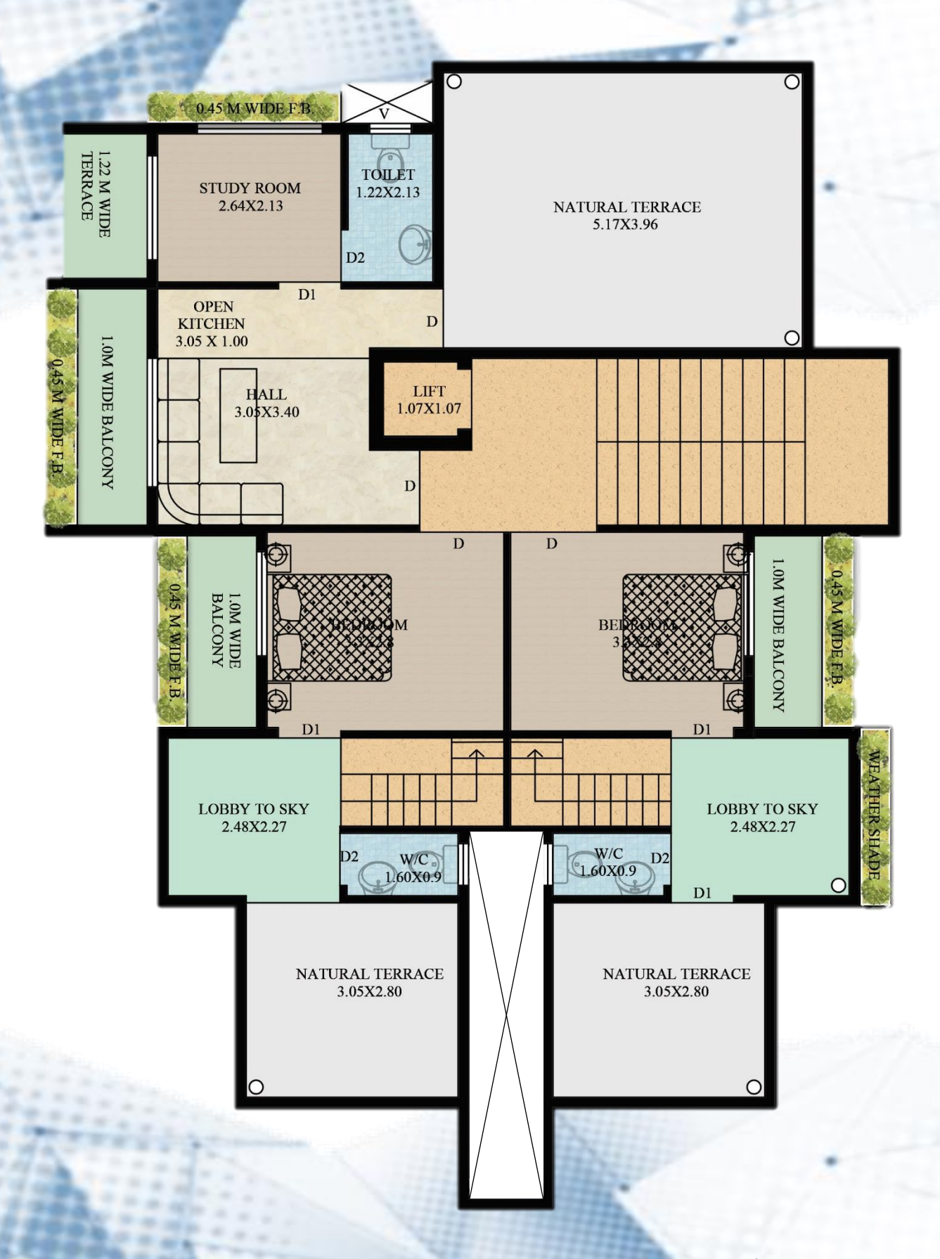
FORTH FLOOR PLAN